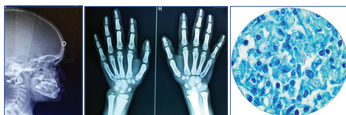
[Table/Fig-6]: Lateral cephalogram showing atrophy of nasal septum which may leads to flatness of nasal cartilage and curvature of cervical spine; [Table/Fig-7]: Hand wrist radiograph showing bone erosion at the tip of first finger in left side and on the tip of thumb region on right side; [Table/Fig-8]: Photomicrograph of the lesion showing numerous acid fast bacilli within macrophages (Fite-Faraco stain; magnification X 40).